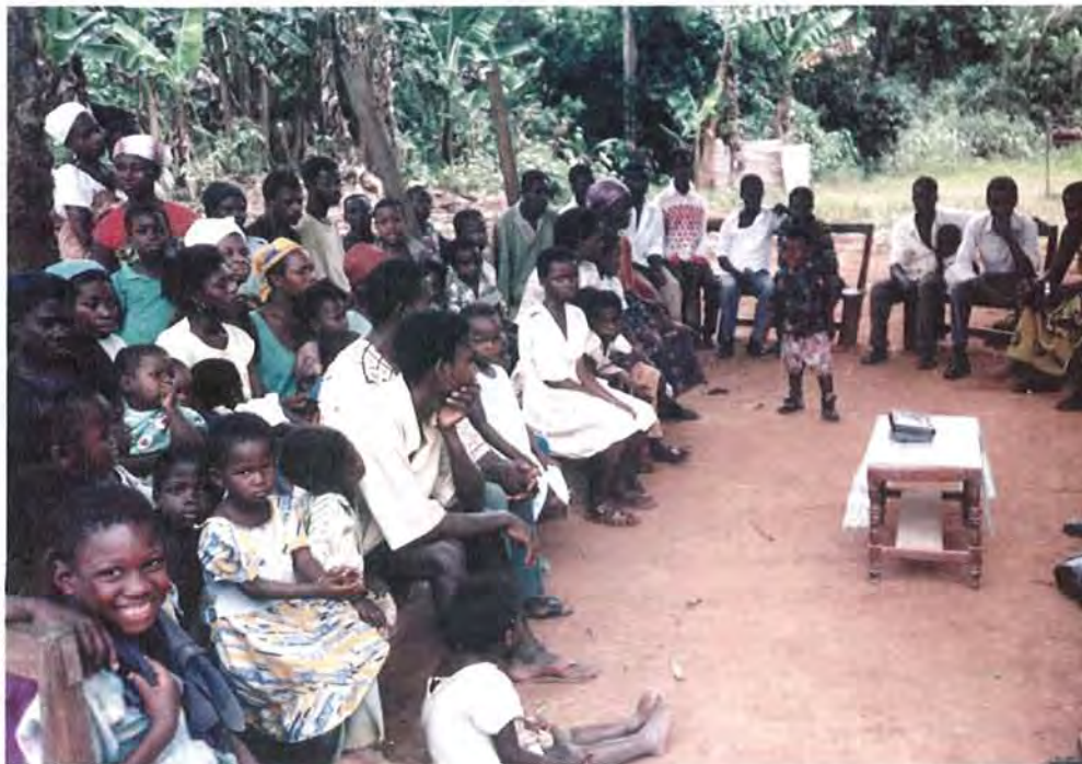
Listening group in Ghana, Africa

Depending on the language, it takes 12 or more cassettes to hold the New Testament and 45 or more if the Old Testament is included. Often people unable to read — the ones most in need of audio Scriptures — can't afford the tapes, let alone a tape player. The FCBH listening plan brings an entire church together to listen to the Scriptures; the New Testament can be covered in 40 half-hour sessions. As they listen, those with limited reading ability and a