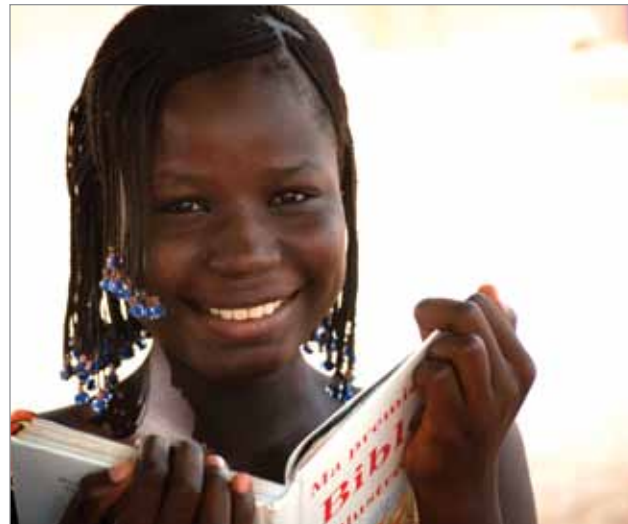
A student at El Bethel Yagma School in Burkina Faso is holding the illustrated Ma Première Bible .

Praise God for the final year of the Yao translation project, asking that we will be able to publish this Bible as soon as possible. Pray for our other translation projects, for the Good Samaritan program and for the National Scripture Recital Extravaganza and Bible Youth Advocates projects. Give thanks for the Bible shop in the north and remember the Faith Comes By Hearing® program and our local fundraising initiatives.