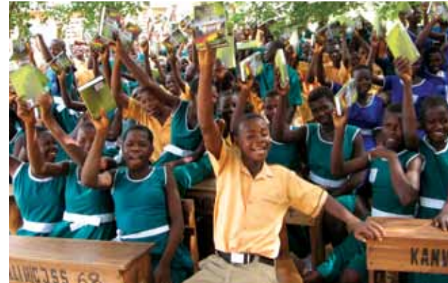
Thanks to our Bible-A-Month partners, these children and many others have been filled with the joy of knowing that Jesus loves them.