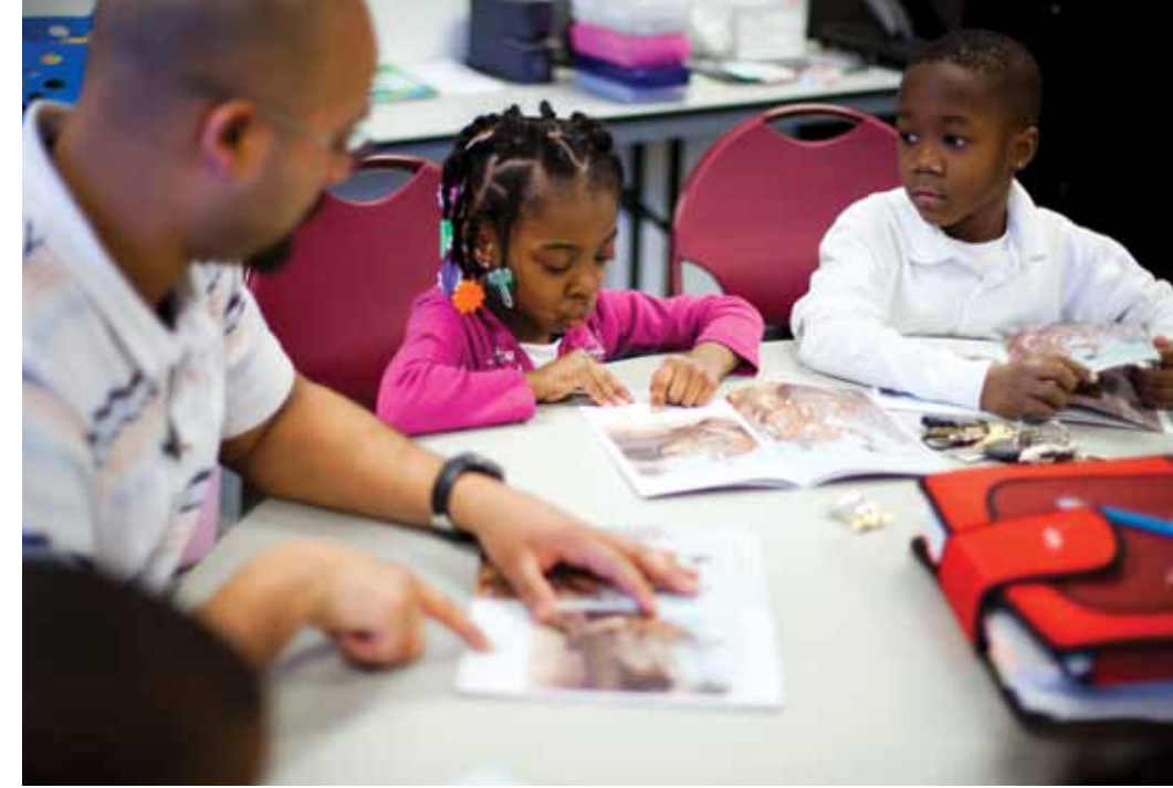
Thirty stories make up the curriculum of Mission: Literacy ; 10 present the life of Jesus, and the rest are Old and New Testament stories. Each is presented in a 28-page illustrated book.