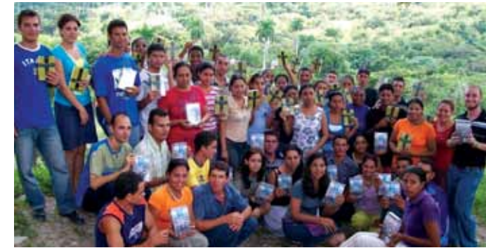
Young Cubans receiving the H 2 O Bible .