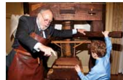
A working model of the Gutenberg Press at Passages exhibition.

Passages , a remarkable Bible exhibition that premiered at Washington D.C.’s Vatican Embassy, brought together church and political leaders to celebrate the King James Bible at 400. Co-sponsored by American Bible Society and the Green Family, the opening event in March shined a light on one of the newest and most exciting collections of rare Scriptures in the world, previewing selections of a larger exhibition now on view at the Oklahoma City Museum of Art.