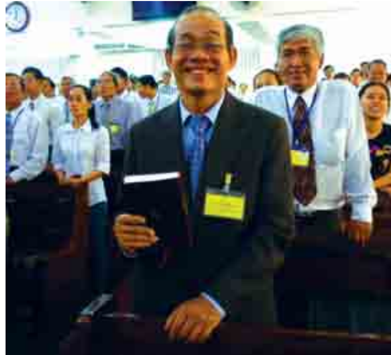
At the dedication and worship service for the long-awaited Revised Vietnamese Bible in Ho Chi Min City, there were more than 400 pastors, leaders and Christian well-wishers. This was a proud and moving moment because pastors from the Evangelical Church of Vietnam, North and South, had worked together on this project.

“Let your hope keep you joyful, be patient in your troubles, and pray at all times.” Romans 12.12 (GNT)