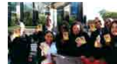
ABS staff handing out invitations to Bible Talk Tuesday on Broadway.

Starting Tuesdays in October, American Bible Society is welcoming New Yorkers off the street into