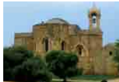
Church of Saint John the Baptist in Byblos ( Jbeil in Arabic). Byblos is the oldest, continuously inhabited city in the world and is where bublos (Egyptian papyrus) was imported into Greece.

Although the translation work is still in progress, results are already beginning to appear. The translation team distributed 1,000 updated translations of the book of Colossians in 2009, and 1,000 updated copies of Revelation during the 2010 Easter season. One Orthodox bishop led his entire diocese through reading the updated version of Revelation. As the translation work continues, Dr. Diab is confident that Scripture will move more deeply into the hearts of Arabic-speaking people.