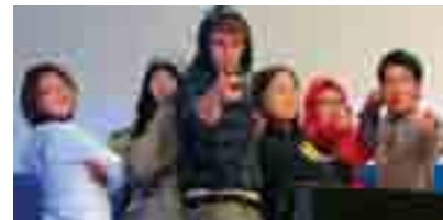
Youth Assembly delegates expressed themselves through drama at the UBS World Assembly in Seoul.

The eighth United Bible Societies World Assembly was held in