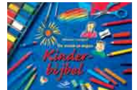
The cover of Make-Your-Own Children’s Bible in Suriname Dutch.

American Bible Society has broken new ground in directing international support for a new Bible Society in Nickerie, the second largest city in Suriname, near the border of Guyana.