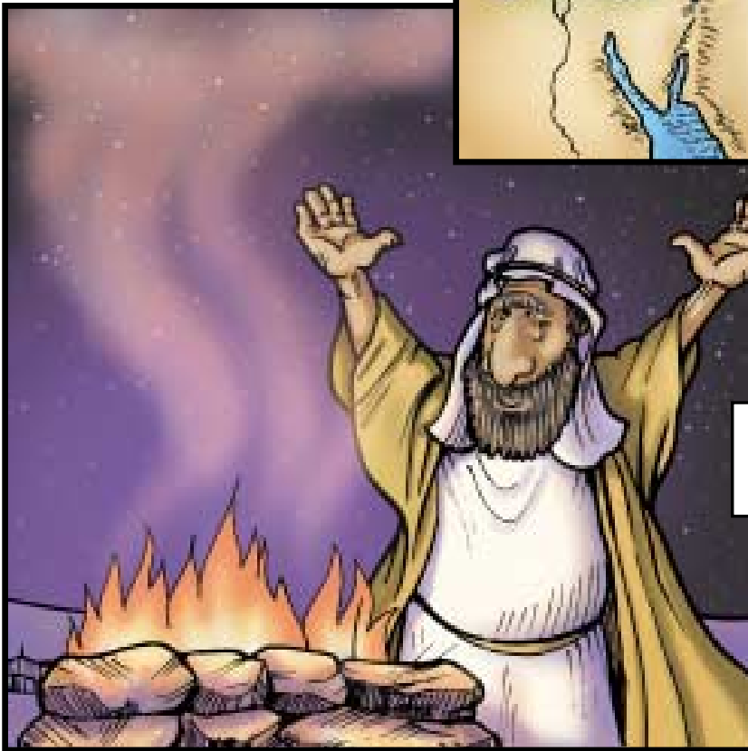
Abram gave thanks to God.