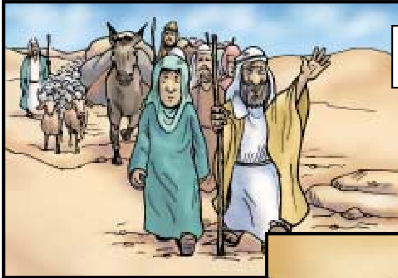
They left for Canaan.