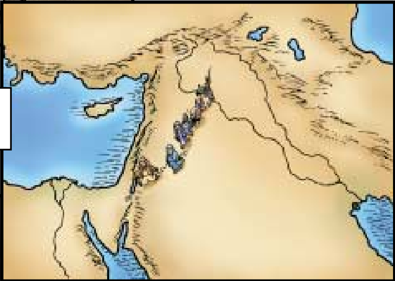
They finally arrived in Canaan.