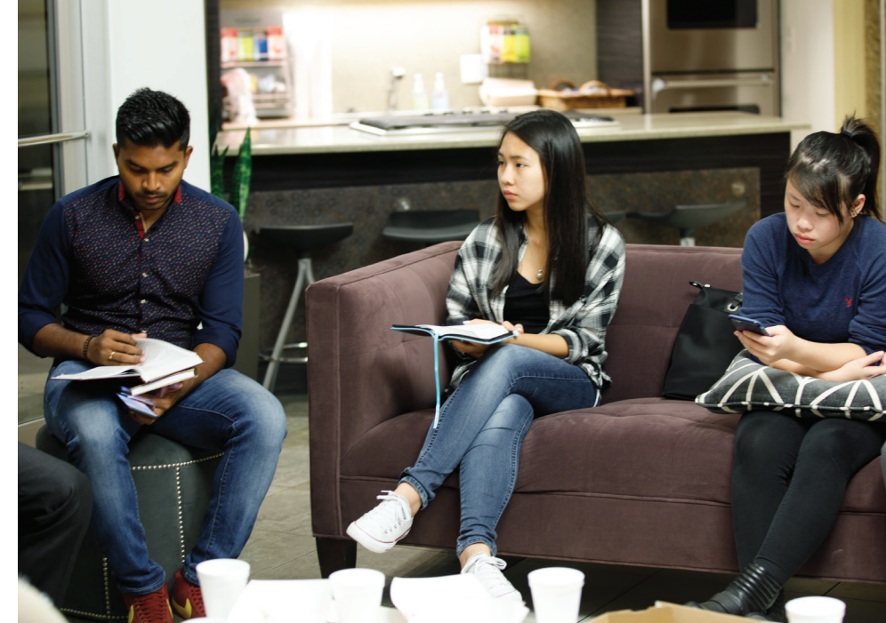
Bible Clusters help spiritually curious people engage with God's Word by providing a safe space for reading, discussion and prayer.