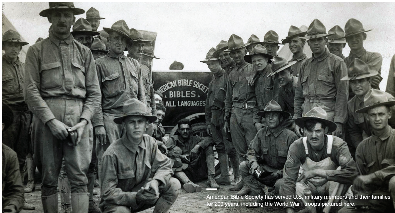
American Bible Society has served U.S. military members and their families for 200 years, including the World War I troops pictured here.