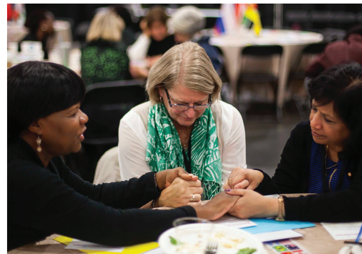
A group of leaders gathers in prayer during Movement Day 2016.

In October 2016, Christian leaders from around the world gathered in New York City for Movement Day, an annual conference hosted by The New York City Leadership Center that focuses on transforming urban communities through collaboration and God's Word. This year, attendees took home a 28-day devotional through the book of Acts from American Bible Society.