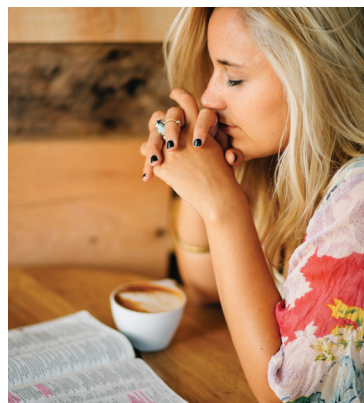
U.S. teens say they wish they read the Bible more.