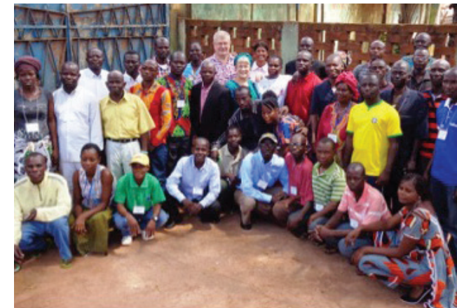
Trauma healing workshops offer spiritual hope in Central African Republic.