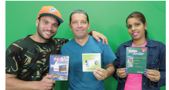
This sign language translation team is bringing God's Word to life for Cuba's deaf community.

Translators are currently working to have the books of Luke and Acts translated and distributed by 2019. The new sign language Bible, which is published through digital videos and DVDs, is bringing the life-changing message of God's