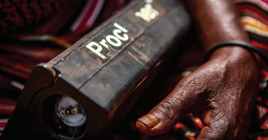
In Rwanda, God's Word is coming to life for non-readers through portable audio Bibles called Proclaimers®.