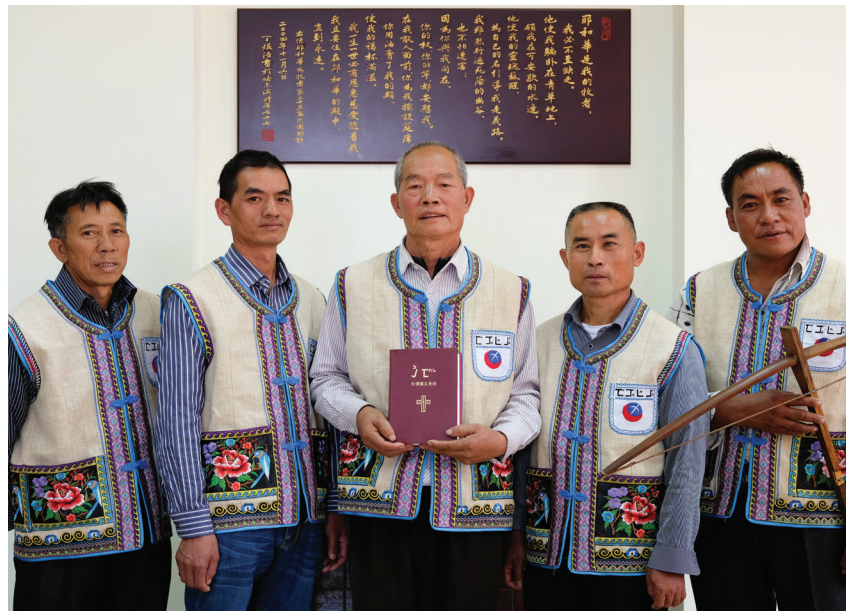
A team of five East Lisu farmers, pictured here, spent nearly a decade translating God's Word for their people. The translator on the far right is holding a bow, symbolizing the strength of elderly people.