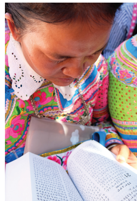
Literacy classes from United Bible Societies China Partnership help the East Lisu people read God’s Word for themselves.

You can help bring the Bible to waiting language groups. Visit ABSRecord.com/Bibles