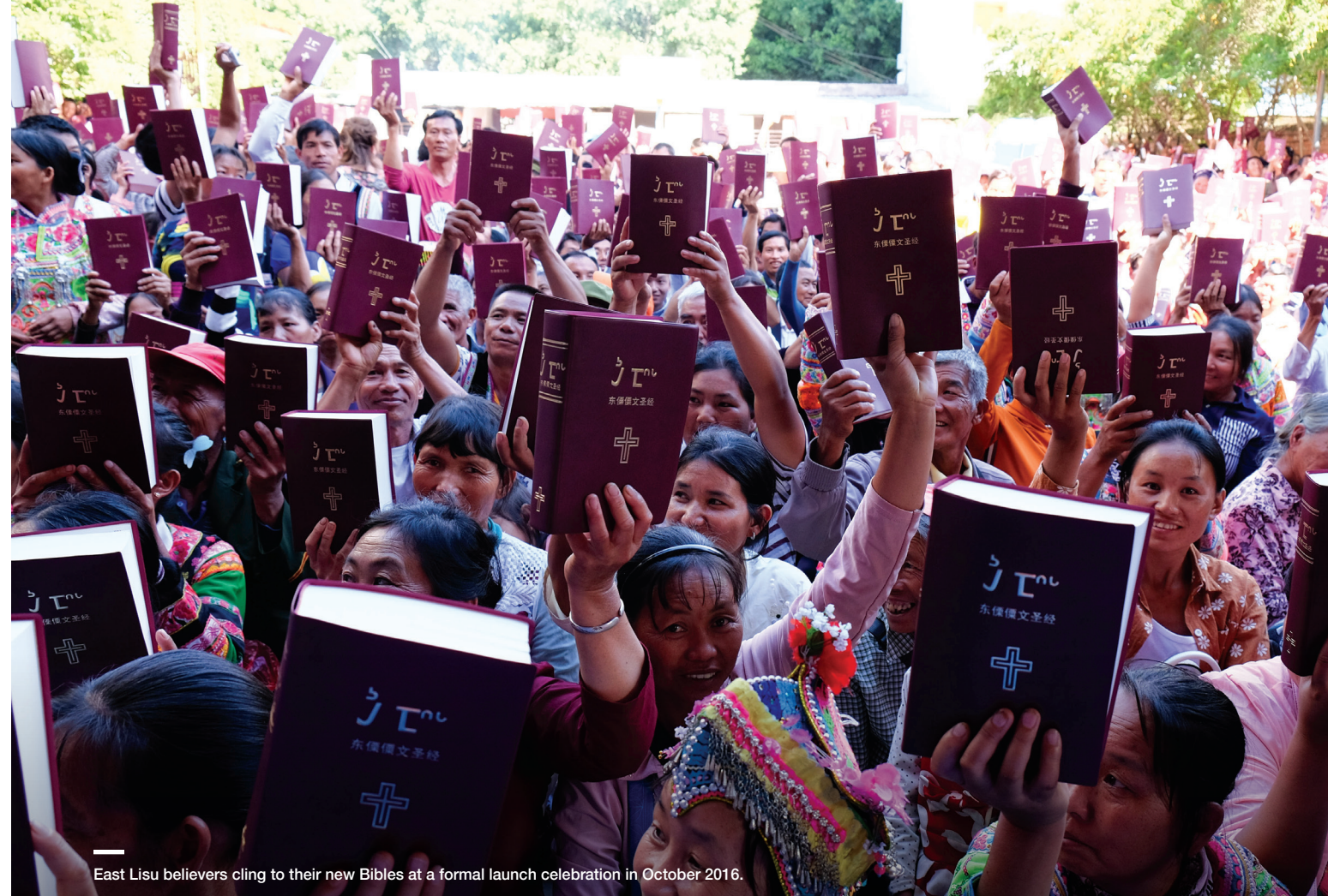
East Lisu believers cling to their new Bibles at a formal launch celebration in October 2016.

translation sites in Kunming and Wuding. Away from home for long stretches of time, they had to hire laborers to do their farming for them.